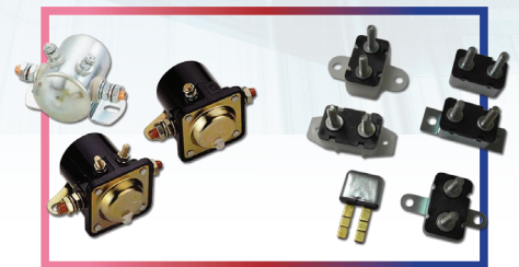
SOLENOID STARTER SWITCH

Zung Sung welcomes OEM/ODM orders from customers around the world, and provides a one-year warranty on all of its products.