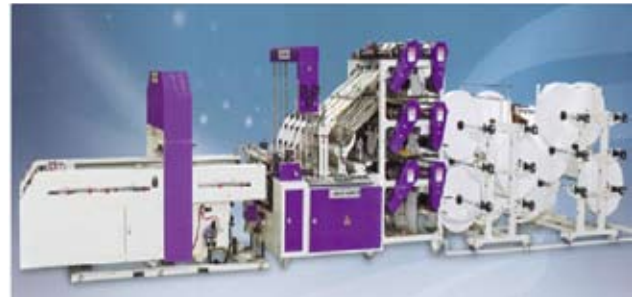
model : BJATRP12L+S

The company 's experienced engineers periodically travel over to visit global customers to provide complete after-sale services via on-site after-service or hands-on training , including machine installation and set-up, changeover and adjustments, maintenance procedures ,diagnosing common problems, and repair techniques