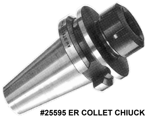
#25595 ER COLLET CHUCK