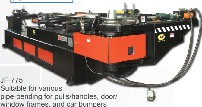
JF-775 Suitable for various pipe-bending for pulls/handles, door/window frames, and car bumpers

Jan Far's tube-processing machine is designed to work on tubes that are widely used in aircraft, transportation equipment (including tankers), buildings (including exterior wall cladding and escalators), tunnel engineering, furniture, refrigeration and air-conditioning products, sports equipment, entertainment facilities, power plants, petroleum-related equipment, water piping, sewage treatment facilities, landscaping, bridges, automobiles, motorcycles, bicycles, chemical engineering, iron processing, and fertilizer making.