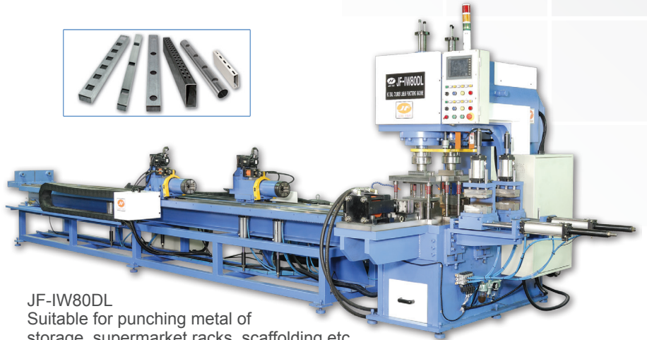
JF-IW80DL Suitable for punching metal of storage, supermarket racks, scaffolding etc.