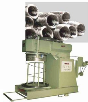
Steel Wire Drawing

Logstics/Storage Equipment Steel Container: